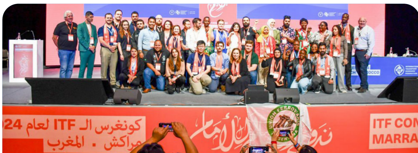
Photo: Representatives of the ITF Young Transport Workers' Committee, 2024

Participation in the event provided an opportunity to represent the interests of young Ukrainian transport workers, as well as to adopt best international practices and implement modern approaches to working with youth.